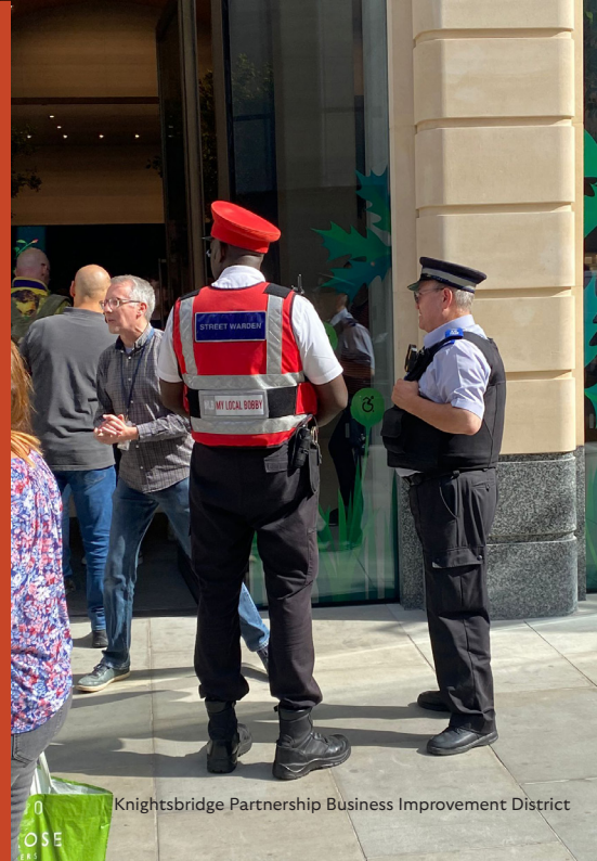
Knightsbridge Partnership Business Improvement District

You can find out more about the BID by visiting www.knightsbridgepartnership.com